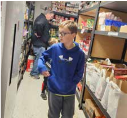
Students helped collect and organize food pantry items at Divine Shepherd, Black Hawk.

Recently, students in our South Dakota Lutheran schools had the opportunity to: