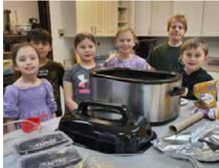
Students get ready to make meals for Orphan Grain Train at Sioux Falls Lutheran