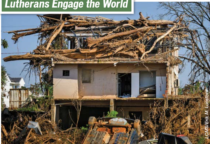
Pictured in July is a house destroyed by rushing floodwaters in Arroio do Meio, Brazil. The latest issue of Lutherans Engage the World features articles on recovery efforts amid disasters in Brazil and Chile.