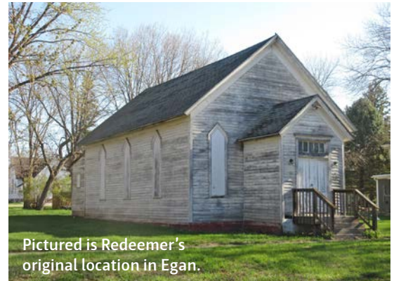
Pictured is Redeemer's original location in Egan.